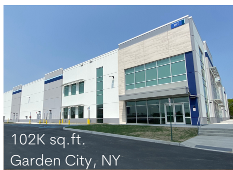
102K sq. ft. Garden City, NY