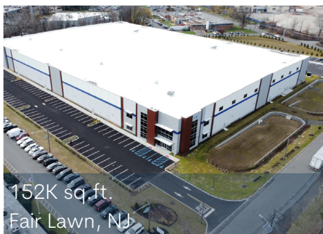
152K sq. ft. Fair Lawn, NJ