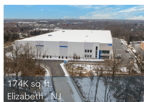
174K sq. ft. Elizabeth, NJ