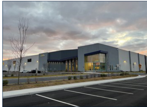
CENTERPOINT AT LINDEN