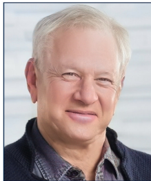
Charles Klatskin Lifetime Achievement Award