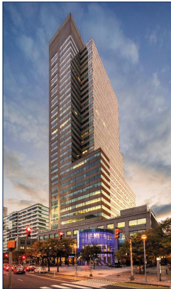
BANK OF AMERICA LEASE AT NEWPORT TOWER