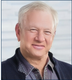
Charles Klatskin Lifetime Achievement Award