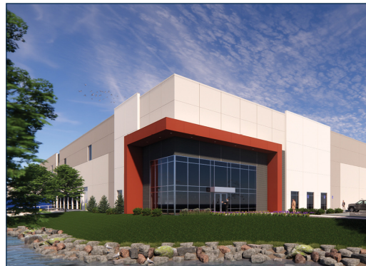
CENTRAL 9 LOGISTICS PARK