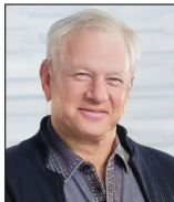
Charles Klatskin Lifetime Achievement Award