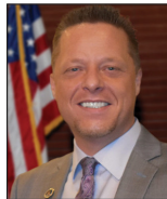
Caren S. Franzini Public Partner Award