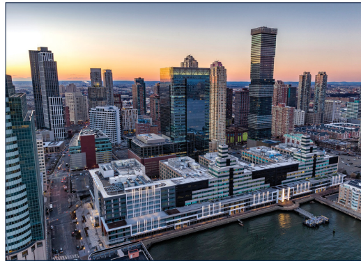
HARBORSIDE PORTFOLIO $524MM SALE