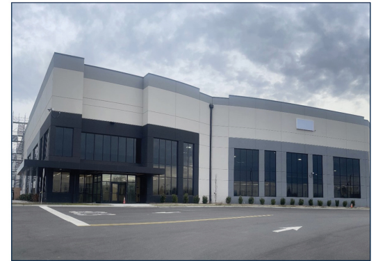
SEAGIS NEWARK AIRPORT LOGISTICS CENTER