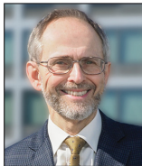
Industry Service Award